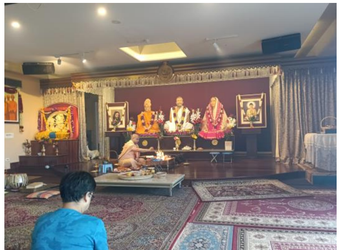
Homa during Swami Vivekananda's birth anniversary