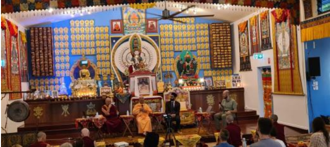
At the Chenrezig Institute, Brisbane