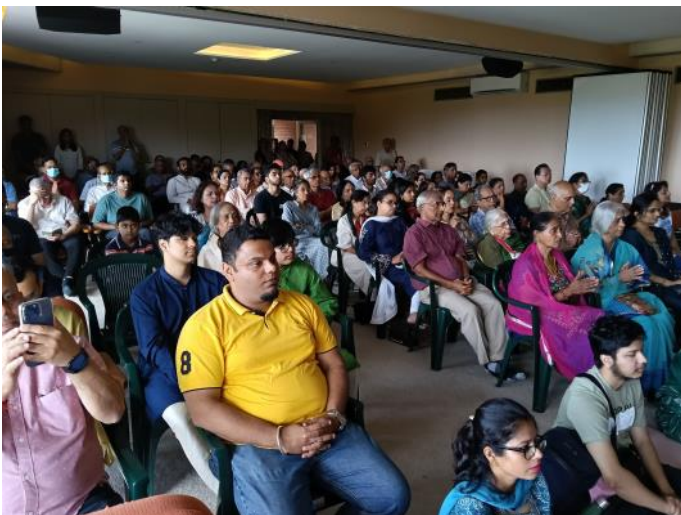
Sri Sarada Devi's Birth Anniversary in Sydney