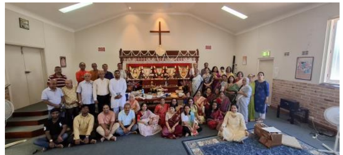
The devotees in Perth at a recent function