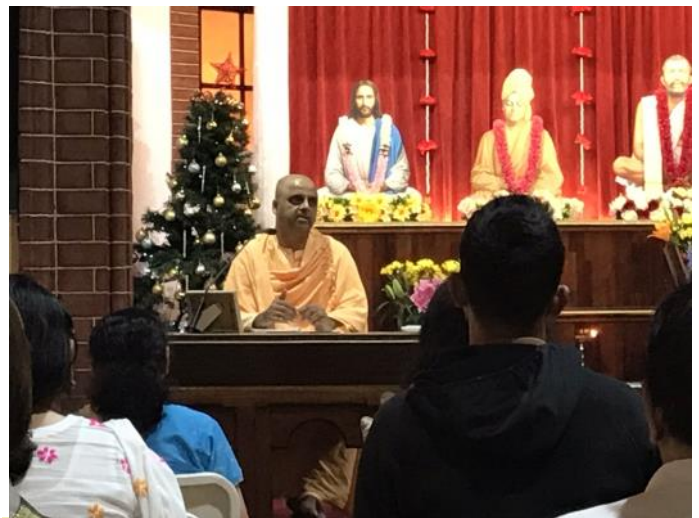
Sri Sarada Devi's Birth Anniversary in Adelaide