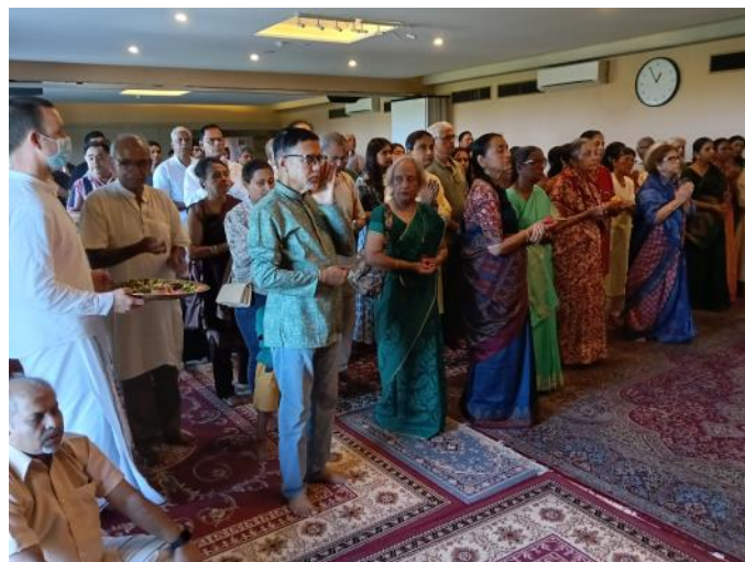
At Sri Ramakrishna's Birth Anniversary in Sydney

pranam mantra composed by Swami Vivekananda.