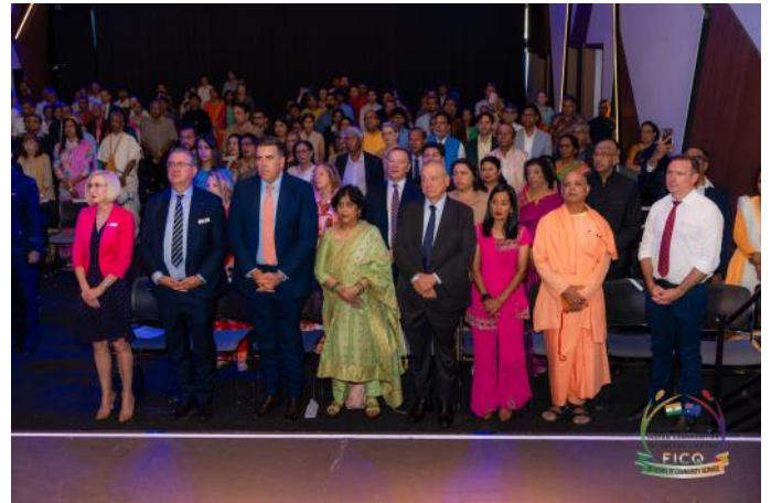
Milton Dick (3rd from left) Speaker of the Federal House of Reps, Paul Scarr (2nd from left) Federal Senator, and others)