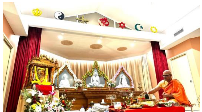
Shiva ratri in Brisbane