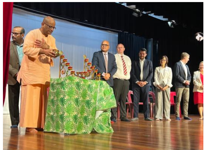
Yuva Divas (Youth Day) Celebrations, Melbourne