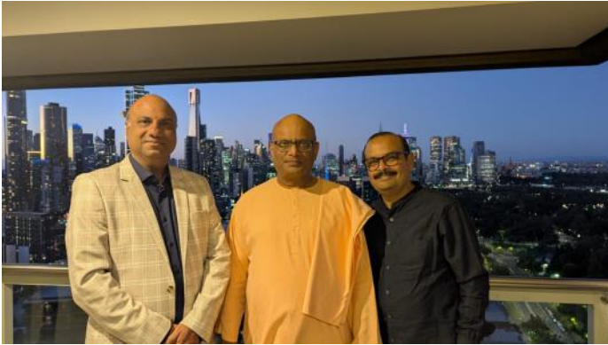
At the Consular General's (Victoria) Residence