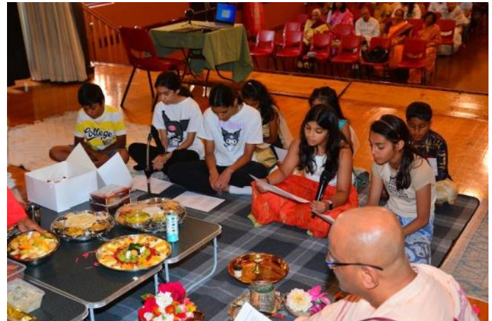
Sri Ramakrishna's Birth Anniversary, Melbourne