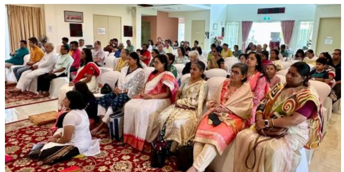
Sri Ramakrishna's Birth Anniversary in Brisbane