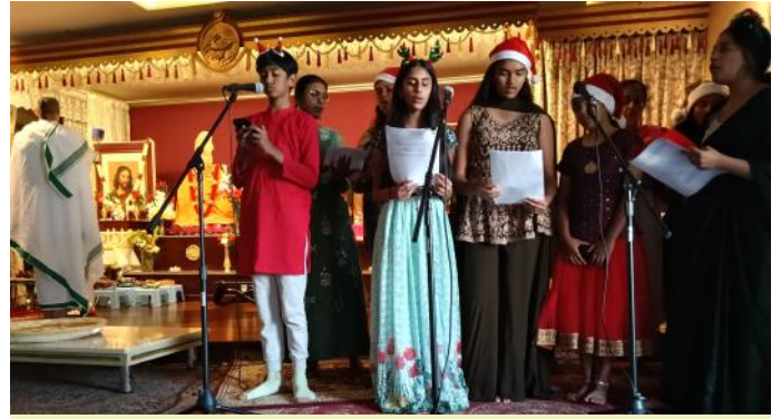
Carols on Christmas Eve in Sydney