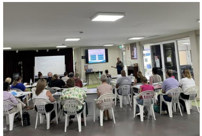
Suicide Prevention Seminar in Brisbane