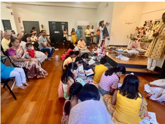
Saraswati Puja in Melbourne