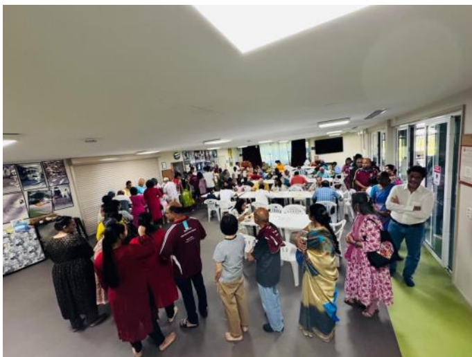
Prasad distribution on Sri Sarada Devi's Birth Anniversary in Brisbane