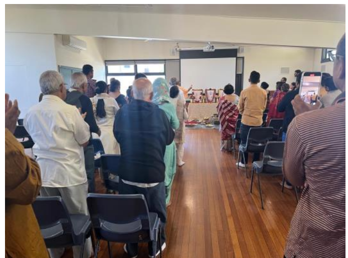
Sri Sarada Devi's Birth Anniversary in Melbourne